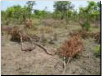
Hand clearing of land by ax

Each farm is expected to develop to about 2,000 acres. This of course will take time over several years, and eventually require larger machinery and harvesting equipment.