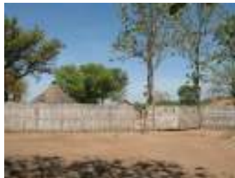
Bamboo Fence Around Compound – very secure

Local records including crops, tonnage, financial accounts and payrolls will be kept locally and duplicated in the records of the Central SFC compound. A generator will be available for each compound and used for a short period only as the sun sets, until about 10:00 pm. Each farm will have a computer for record keeping. Electric lights will also eventually be installed in the main buildings on each compound.