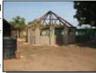
Common Room Under Construction

A vegetable garden will be maintained on a year round basis to provide fresh produce for the table within the compound. Local produce will be bought when visitors are on site as well.